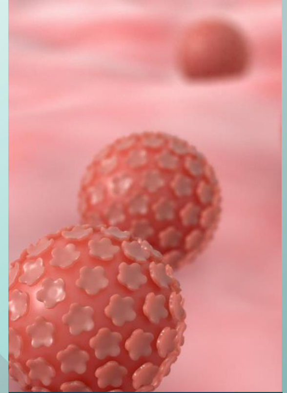
HUMAN PAPILLOMAVIRUS (HPV)